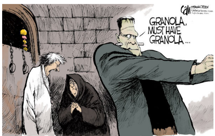
'YOU FOOL, IGOR, DO YOU SEE WHAT YOU'VE DONE?! YOU ACCIDENTALLY MIXED THE LIBERAL AND NDP BRAINS!"