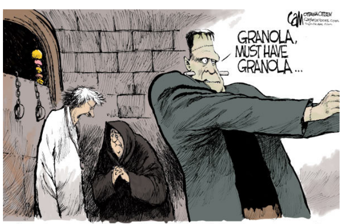
"YOU FOOL, IGOR, DO YOU SEE WHAT YOU'VE DONE?! YOU ACCIDENTALLY MIXED THE LIBERAL AND NDP BRAINS!"