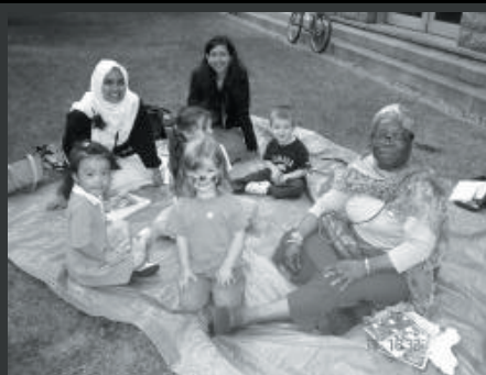
APUS Summer BBQ

The APUS membership referendum for a COLA increase passed, with 72% voting in favour. APUS would like to thank all of our members for their support.