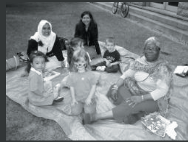
APUS Summer BBQ

The APUS membership referendum for a COLA increase passed, with 72% voting in favour. APUS would like to thank all of our members for their support.